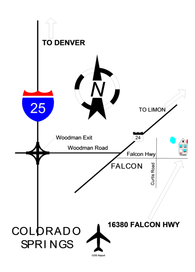
From I-25 North or South: Take Woodmen Road Exit and travel east to Highway 24. Turn Right on Highway 24 and then turn Left on Meridian. Go to stop sign and then Turn Left on Falcon Highway. Turn Left in driveway at 16380 Falcon Highway.